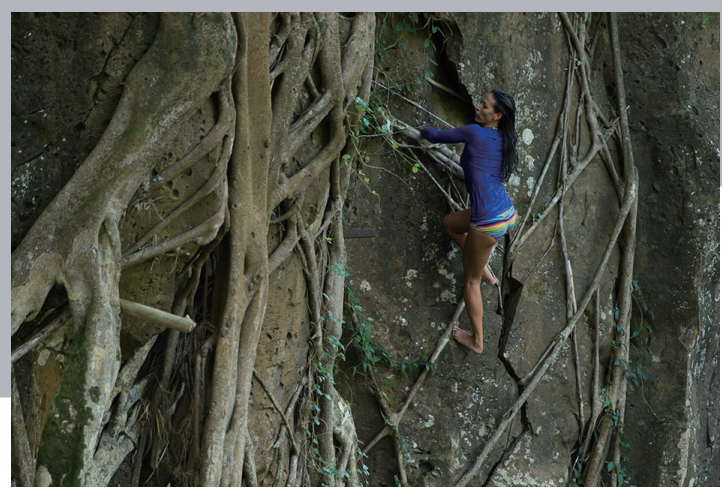
TAKING THE PLUNGE DAY ONE, 17:30 CLEAR, CALM SUNSHINE